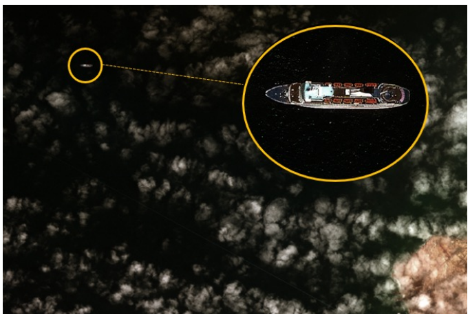
CMS/IMS proved key in detecting and identifying the vessel of interest