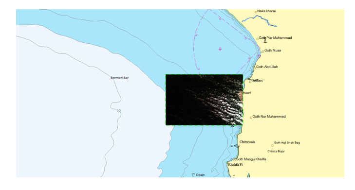
The ship was tracked to Gadani coastline in Pakistan, approx. 100nm from a shipbreaking beach

Under new investigated ship data (name, flag, MMSI number and IMO number) and using CMS optical products and EMSA's vessel traffic data, DEWP traced the vessel's course from its initial departure point within the EU to the sea area off Gadani (Pakistan), approximately 100 nautical miles before a shipbreaking beach, where it stopped transmitting AIS data again.