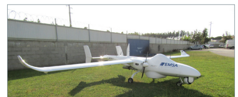
Marine Pollution Monitoring & Maritime Surveillance