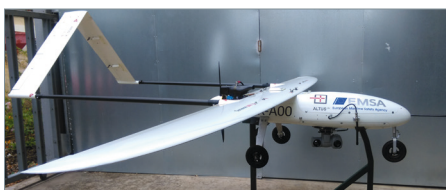
Maritime Surveillance & Emissions Monitoring

RPAS can undertake a wide range of missions. EMSA has different RPAS types and payload configuration in its portfolio to be able to cover different user needs. Depending on the mission, RPAS fly close to shore, i.e. within Radio Line of Sight (RLOS) or further offshore, i.e. Beyond Radio Line of Sight (BRLOS) using satellite communication. All aircraft control communications are via a Local Ground Station. The RPAS with their payload configuration are multi-purpose in nature, e.g. it is also suitable for different vessel monitoring and detection activities.