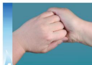
4 Rub fingertips and fingernails of both hands together thoroughly