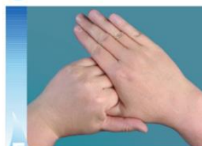
5 Rub thumb of each hand thoroughly