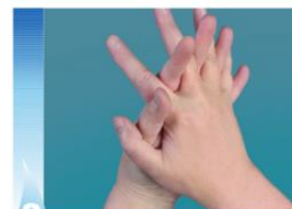
3 Rub thoroughly between all fingers