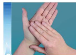
6 Rub each palm thoroughly