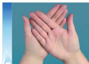
2 Rub right palm over left dorsum and vice versa