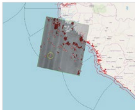
The support from CMS enabled partners to identify suspect vessels.