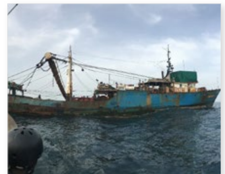
Photo of one of the suspect vessels taken during the operation.