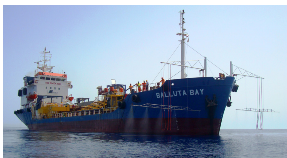
Slick detection system