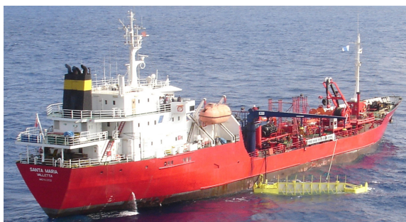
Slick detection system