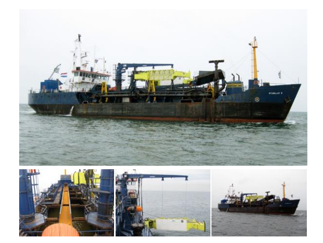
Slick detection system