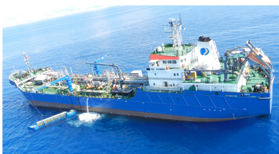
Slick detection system