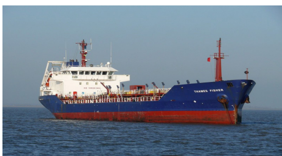
Slick detection system