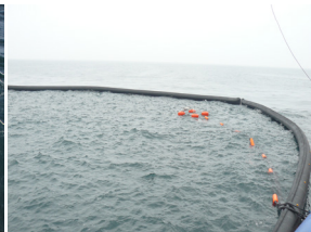
Boom and skimmer