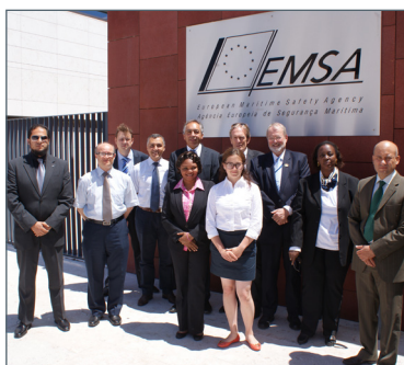
WMU trainers and students with EMSA hosts

Six students of the Malmö-based World Maritime University visited EMSA on 1-2 July together with one of their professors. This was part of their field training for a maritime education and training master's course which also included visits to some Portuguese institutions.