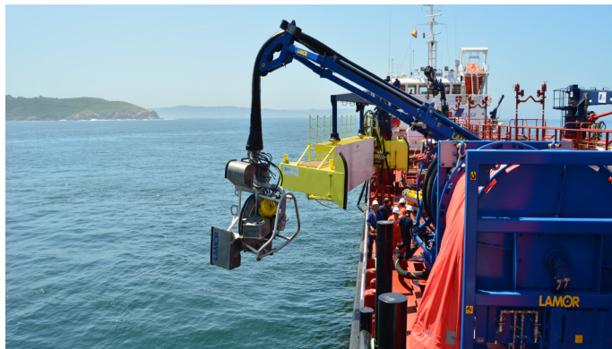
Monte Arucas oil response equipment put into action

The Monte Arucas tanker has joined EMSA's network of standby-oil spill response vessels after passing the acceptance test held in Ferrol, Spain on 3-4 July. The vessel owned by Sertosa Norte and operated by Naviera Urbasa brings an additional 2,940m 3 of storage capacity to the network as well as state-of-the-art oil recovery equipment, including a high capacity skimmer, ocean oil boom, rigid sweeping arms and oil slick detection system. The Monte Arucas , stationed in Ferrol, will provide pollution response to the Bay of Biscay, where maritime traffic is heavy, particularly on the route that runs from the English Channel to the strait of Gibraltar.