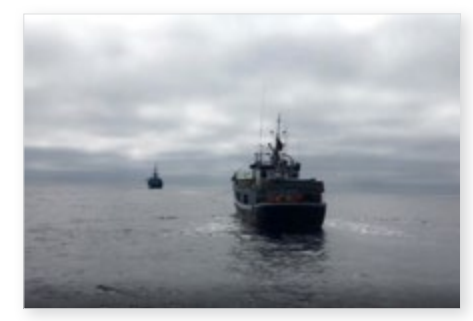
The fishing vessel 'Gure Leire' being towed by the Spanish Customs vessel 'Fulmar'.