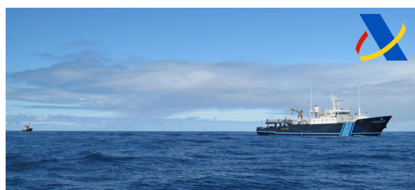
Offshore patrol vessel Petrel I towing the Venezuelan flagged fishing vessel