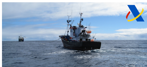
Offshore patrol vessel Petrel I towing the Venezuelan flagged fishing vessel