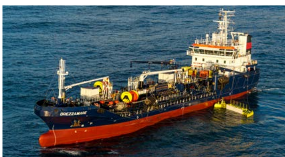
Slick detection system