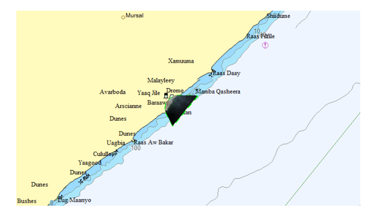
CMS images support maritime security operations off the coast of Somalia

CMS optical images and the vessel detection service (VDS) support EUNAVFOR in detecting vessels and activities of interest in their area of operation.