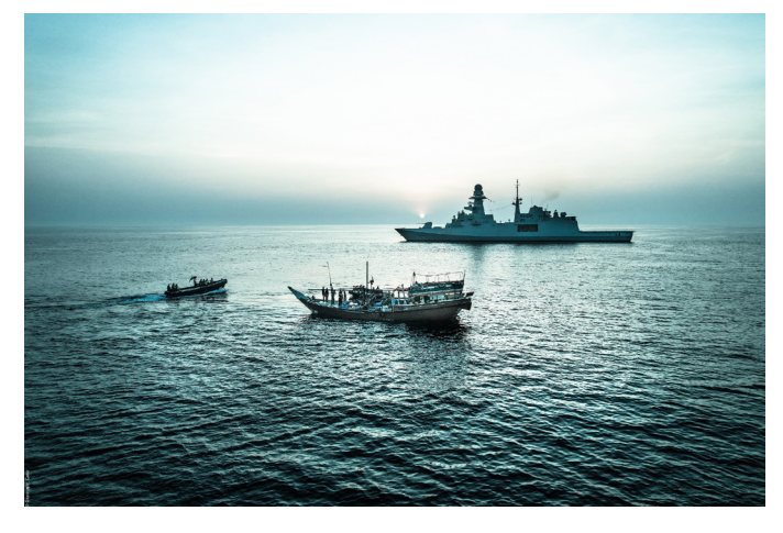
Maritime security operation