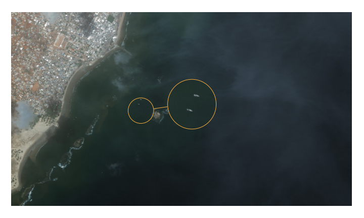
Satellite images help EUNAVFOR to detect vessels along a fishing port