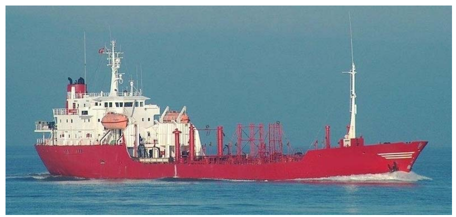
EMSA oil pollution response vessel Santa Maria

The CleanSeaNet leaflet will describe EMSA's work in detecting pollution by using low earth orbit satellites. Ships often discharge oil and other pollutants into the sea, either accidentally or deliberately, and satellite monitoring is an efficient and cost-effective way of detecting these events. The data from the satellites is downloaded to receiving stations, analysed, processed and sent to the most appropriate users. In cases where the pollution has not already been reported, the system gives Member States the information that they need to assess the situation in greater detail and, if necessary, to take action to identify and prosecute the polluters. This will be one of a series of pollution related publications which are released on a regular basis. For example, an update of the Inventory of EU Member States Oil Pollution Response Capacities will be published in 2007, as well as the first EU inventory of hazardous and noxious substance (HNS) emergency response capabilities . In addition, the Marine Pollution Response Assistance: Frequently Asked Questions publication was re-printed at the beginning of 2007 due to popular demand.