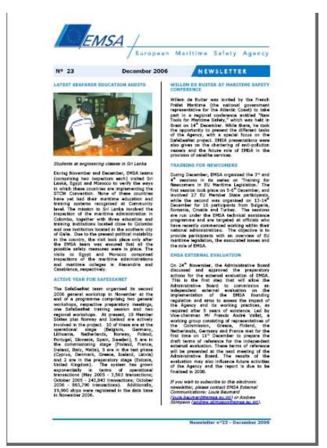
EMSA monthly newsletter

In addition to the previously mentioned publications, EMSA has a legal requirement to produce two key documents as part of the annual budgeting cycle. These are the work programme, which gives the outlook for the year ahead, and the annual report, which summarise the work done in the previous year. After adoption by the Administrative Board, these documents are submitted to the European Parliament, the Council, the Commission and the Member States. They are also published on the EMSA website and made available more widely to stakeholders in hard copy. The Work Programme 2007 and the Annual Report 2006 will be published in early 2007.