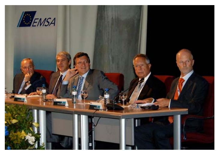
High level representatives at EMSA on Inauguration Day

Close behind are the Member State government maritime administrations and organisations, and it is vital that the Agency continues to have the best possible interpersonal relationships with these organisations, in order to achieve the desired developments and improvements in line with EU policy. EMSA has therefore established close ongoing relationships with the appropriate people in all of these organisations.