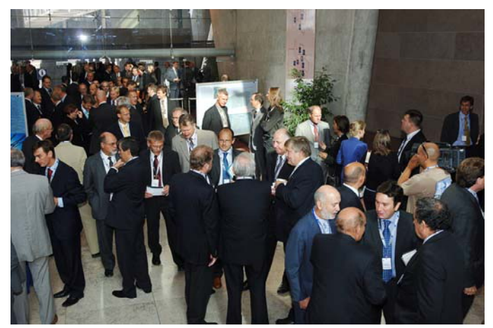
Stakeholders take a break at an EMSA event

The aim is to consolidate the efficient and effective integration of the EU institutions, Member State and international organisations, industry and other stakeholders into the EMSA network, so that the greatest possible benefit can be obtained from their interaction. From a communications perspective, this will be achieved by operating an extensive events programme in order to further improve the productive exchange of information and dissemination of best practice between EU Member States and other interested parties in the network.