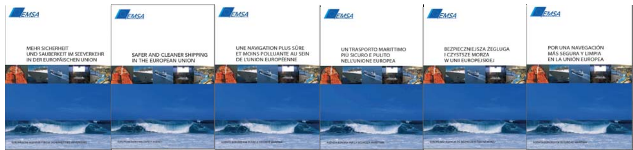
The EMSA brochure was printed in 20 languages and can be seen on the website

Also targeting the same groups are the Agency's media related activities. These involve the set up of media interviews and meetings, the generation and distribution of press releases and, when appropriate, the supply of information for articles published in the press. There was a significant increase in media interest in the work of EMSA during 2006, due largely to the maturing of existing assessment and inspection tasks and to the development of new operational tasks. This interest is expected to continue during 2007.