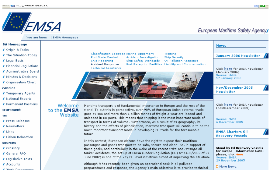
The homepage on the EMSA website

EMSA's most important information and communication tool, the website, falls into this category. It is the primary source of information on its activities for all stakeholders and is a widely accessed site. It is fundamental that it contains all the necessary information for stakeholders and that it enables them to get where they want to go quickly. At the beginning of 2007, an average of around 10,000 page views per day were recorded, and this is rising. Both the website and intranet are in a continuous process of improvement and updating, and the appearance of the website will be modified in early 2007, prior to a significant overhaul once the new CMS is operational. It is intended that this will provide greater flexibility and efficiency in structuring, accessing and presenting the information on the site.