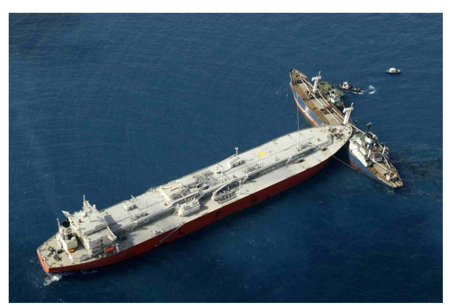
EMSA provides daily information on accidents

In order to ensure that EU level decision makers in EMSA and the European Commission can obtain timely notification and information should a maritime disaster occur, the Early Warning Alert Mechanism (EWAM) monitors international newswires and other key sources 365 days per year. In parallel, having been set up in 2006, a system for ensuring that the Agency is quickly notified of major actual or potential oil spills, and for notifying and mobilising its contracted oil pollution response vessels, is now fully operational.