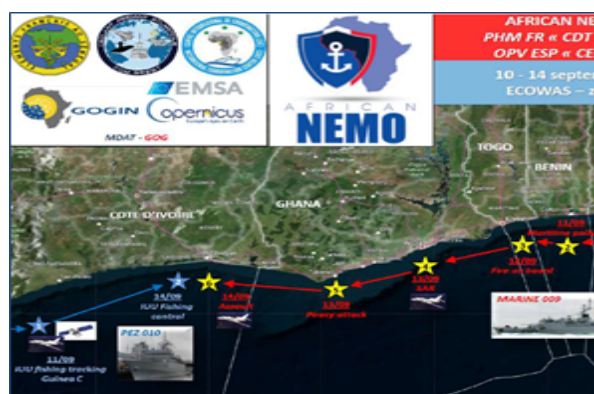
CMS supports the UNODC Maritime Crime Programme

Copernicus, the European Union's Earth Observation Programme, delivers operational data and information services to support a broad range of environmental and security applications. The European Maritime Safety Agency (EMSA) is responsible for implementing the Copernicus Maritime Surveillance Service.