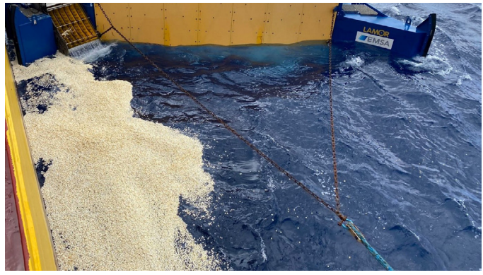
Demonstrating the ability to recover oil spills by collecting simulated spill material, in this case popcorn