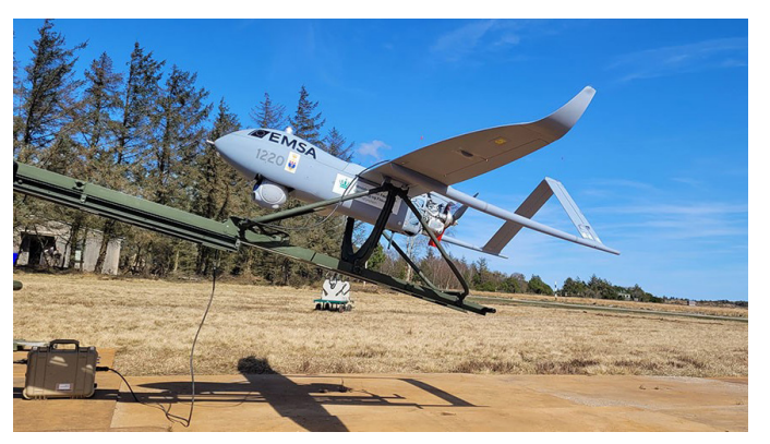
The Aerosonde RPAS uses a catapult for take-off and is recovered with a net. It has an endurance of ten hours and a radio range of 140 km.

EMSA is for the second year supporting authorities in Denmark in a variety of coast guard functions. The Royal Danish Navy in cooperation with the Danish Customs and the Danish Fisheries Agency are benefiting from a multipurpose RPAS surveillance service offered by EMSA. Operational flights started in mid-April are delivered by EMSA through the contractor Nordic Unmanned AS operating an Aerosonde RPAS over a four-month period. The RPAS uses a catapult for take-off and is recovered with a net, has an endurance of ten hours and a radio range of 140 km which can be extended based on ground relay stations. It is equipped with both an optical and infrared camera, as well as an AIS receiver. EMSA's service increases situational awareness directly in the Danish Operational centres where the data gathered from the flights is shared live through the EMSA RPAS Data Centre. This service allows the Danish users to monitor any unusual activity at sea with a potentially harmful impact on the safety and security of persons and vessels in the area or affecting the environment itself. Namely, the service makes it possible to monitor and alert authorities in case of drifting objects spotted at sea which may pose a danger to vessels in the vicinity and/or the environment as well as helping to identify, verify and provide information on potential oil spills and discharges at sea. In doing so, the service complements the EU's satellite-based service for oil spill detection, CleanSeaNet.