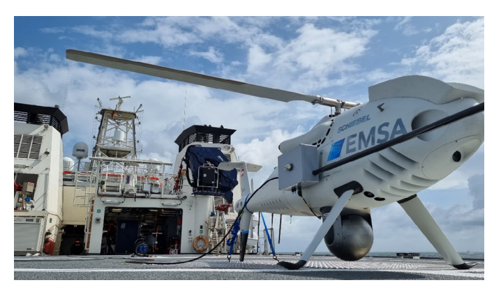
EMSA RPAS located on the helideck of the patrol vessel of the German Federal Police. The air vehicle is equipped with special gas sensors (grey box and pipe on the flank) and optical cameras (turret on the belly).

In Germany, the service is being provided to the German Federal Police and German Federal Maritime and Hydrographic Agency (BSH). The operations are conducted from a Potsdam-class police vessel, which is currently patrolling the German Exclusive Economic Zone. This vessel is equipped with a standardized helideck where the remotely piloted air vehicle can take-off and landing. The data acquired by the RPAS, such as live video and gas measurements, are streamed via satellite communication to the RPAS Data Centre enabling the tracking of the flights and visualisation of the data collected in real-time.