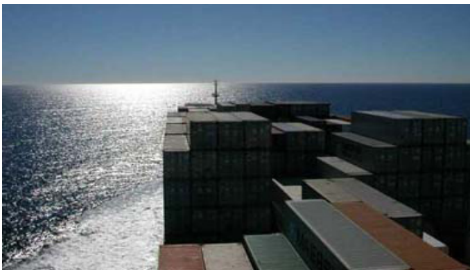
Towards a more complete maritime picture for users

Member State representatives attended a one day meeting on the Integrated Maritime Data Environment at EMSA on 28 February. IMDatE aims to combine and correlate data from various sources, in particular EMSA applications in accordance with existing access rights. The idea is to define with end users improved services and enhanced situational awareness. Around 40 participants watched a demonstration of the prototype's main features and heard about EMSA and the Commission's views on integration activities, as well as the economical and operational principles behind the project.