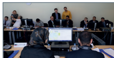
Training session for CleanSeaNet operators, 18-19 March

The first nine-month quarter of the 36-month-long SAFEMED III project to protect Mediterranean waters against the risk of accidents at sea and marine pollution is now over. Many events have