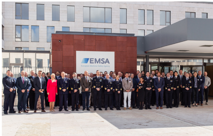
The European Coast Guard Functions Forum workshop, held at EMSA, and co-hosted by EMSA and the Italian Coast Guard, gathered delegates from all over Europe.