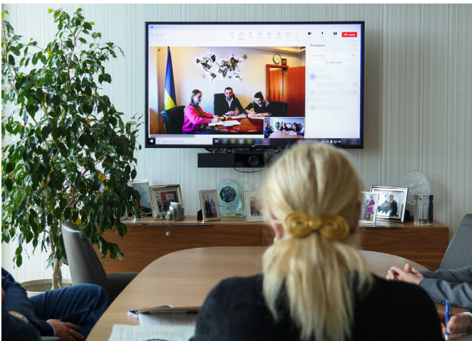
Remote EMSA meeting with the Acting Head of the State Service for Maritime, Inland Waterways Transport, and Shipping of Ukraine