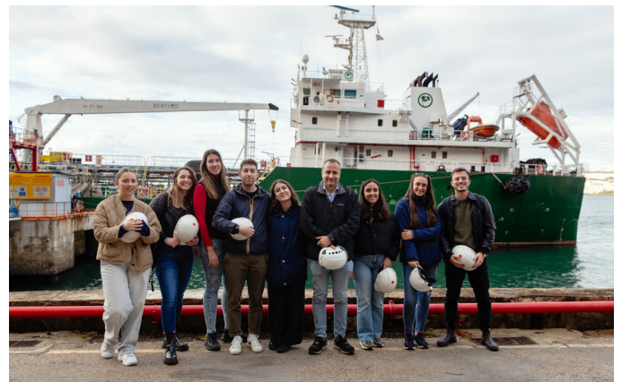
EMSA's 2024-2025 trainees visit the chartered oil spill response vessel Bahia Tres as part of their introduction to our Agency and its tasks.

For the first time, EMSA is holding a virtual Traineeship Open Day, a live webinar session produced by the EMSA Academy. The webinar is linked to the publication of the 2025-2026 traineeship scheme and is aimed at potential applicants. During the webinar, the traineeship scheme will be explained, and current EMSA trainees will give insights into their experience. The webinar will be broadcast live on YouTube on 14 May 2025 at 11:00 CEST. The applications for the traineeship scheme close on 26 May. Find out more on EMSA's LinkedIn.