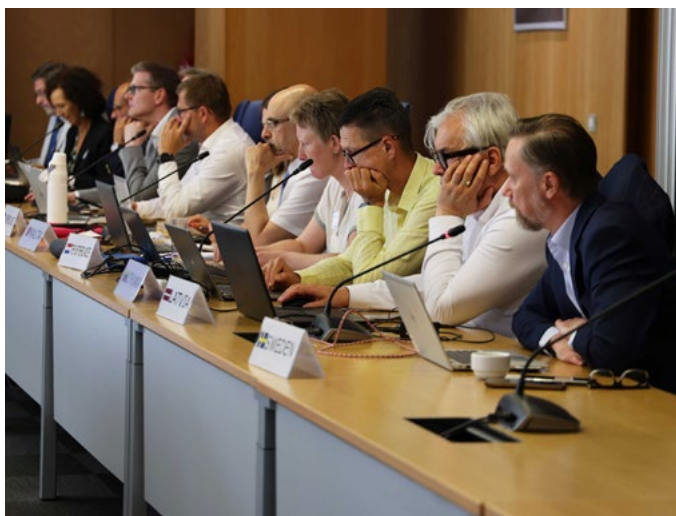
The PCF meeting gathered representatives from around the EU to discuss cooperation and to share best practices.