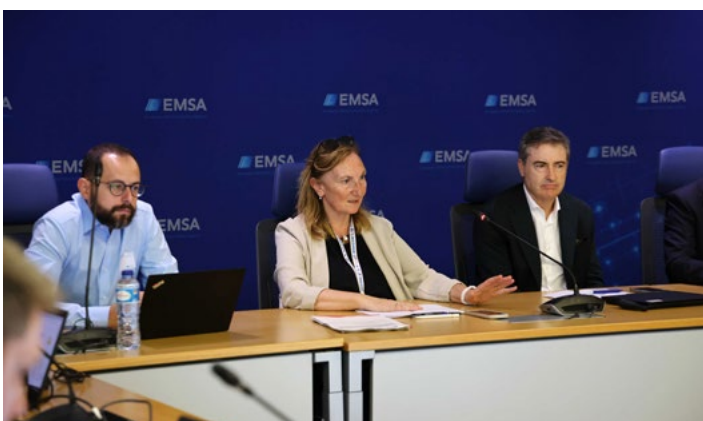
The sessions allowed administering authorities to ask questions and give feedback on the THETIS-MRV tool to EMSA experts.