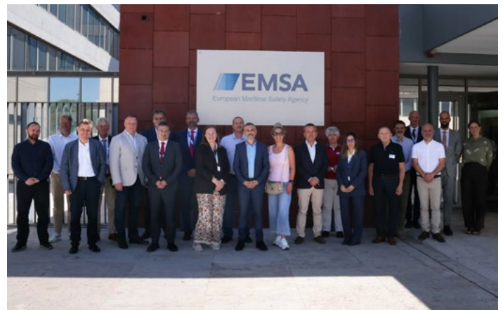
The meeting brought together CNTA focal points as well as Flag State experts, DG MOVE and EMSA to discuss future learning services, training needs, and capacity building for Member State administrations.

EMSA is hosting representatives from EU and EEA Member States on 30 June and 1 July for a dedicated Workshop on Training and Capacity Building for Flag States and the Consultative Network on Technical Assistance (CNTA) Annual Meeting. The events bring together CNTA focal points, Flag State implementation experts, DG MOVE and EMSA representatives to discuss future learning services, training needs and capacity-building priorities for maritime administrations. Following a bottom-up approach, particular attention will be given to the further development of learning services and capacity building initiatives linked to Flag State responsibilities. The CNTA Annual Meeting focuses on the results of the Training Needs Analysis and the proposed EMSA Academy learning services for 2027. Participants will also review recent developments in the EMSA Academy portfolio, including MaKCs, VRESI and the Exchange Programme for Sulphur Inspectors. The active involvement of the different stakeholders in the discussions underline the importance of further enhancing EMSA's training and capacity-building portfolio that complements national training schemes, is aligned with Member States' evolving training needs and strengthens cooperation and the exchange of best practices among Member States.