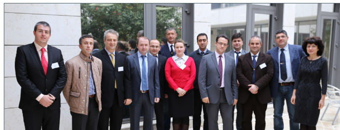
Greater insight possible through simulated auditing scenarios

A two-day course for candidate and potential candidate countries was held at EMSA on 14-15 January. The course focused on a simulated ISM audit for passenger ships and was delivered by two representatives from the Italian Coastguard and an EMSA expert. Officials attended from Albania, Bosnia and Herzegovina, Montenegro and Turkey. The course covered several case studies, examining possible problems and how these could be tackled. The idea is to help participants develop a practical approach to passenger ship auditing techniques, and to improve their understanding of the latest ISM Code changes.