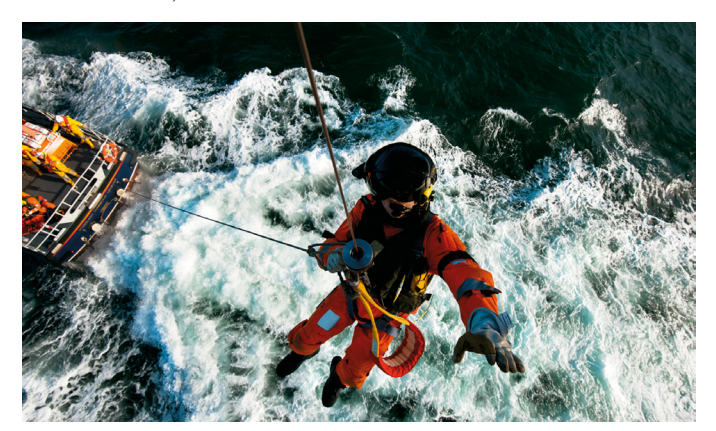
Search and rescue is one area where EMSA can tailor maritime information to user needs, thereby contributing to a comprehensive overview of activity at sea

Maritime surveillance: cooperation in practice is the theme of the upcoming conference being held at EMSA, Lisbon, on 7 May. The purpose of the conference is to bring together public bodies working at the forefront of maritime surveillance. To implement effective maritime policies, governments and EU institutions need detailed, reliable, evidence-based knowledge about what happens at sea, in real time. New and innovative technologies are increasingly available, leading to more comprehensive and effective maritime surveillance. The conference will provide a forum for the exchange of new ideas and perspectives, and an opportunity for maritime authorities to be updated on recent trends and developments. Speakers include representatives from the European Parliament, Frontex, EFCA, EASA and ESA, as well as national administrations.