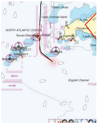
Tracking a polluting vessel