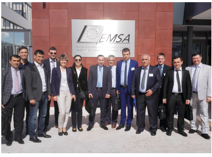
Participants of the TRACECA II workshop on traffic monitoring on 27-28 April 2015 in Lisbon