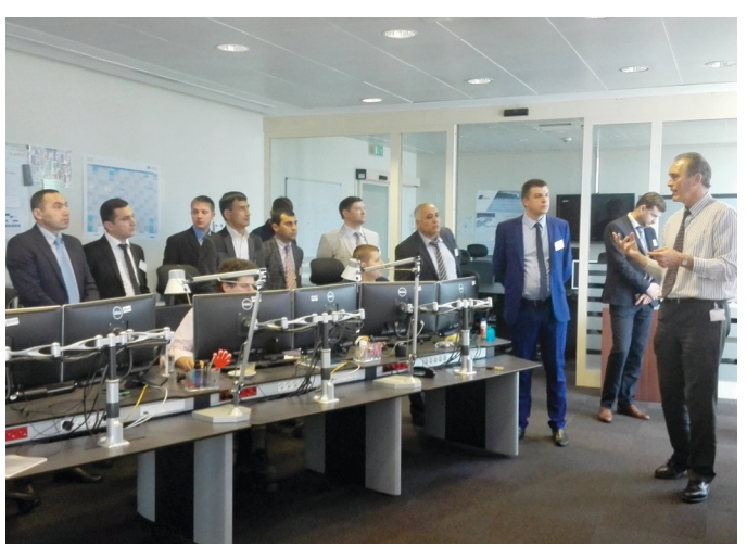
Workshop participants get an overview of EMSA's traffic monitoring services in the Maritime Support Services operations room