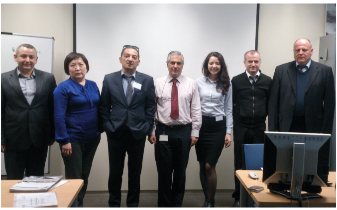
Training session for CleanSeaNet operators