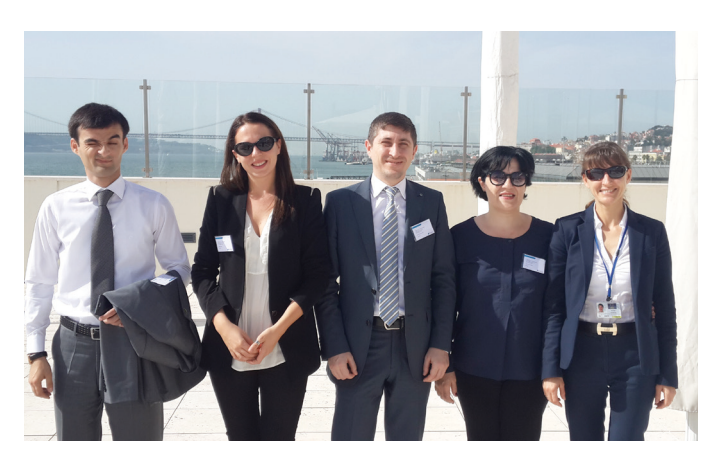
Participants in the CleanSeaNet information session

The seminar was attended by representatives of Azerbaijan, Georgia and Ukraine. More activities will be held in this area before the end of the project.