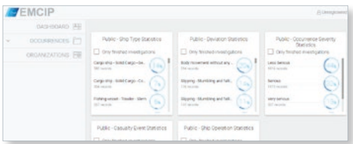
Under the occurrence tab, a whole range of accident-related statistics are displayed with filtering options available.

Data from the European Marine Casualty Information Platform (EMCIP) is now available for online consultation by all. The EMCIP database which stores and analyses information on marine casualties and incidents has been up and running since 2011 and contains a wealth of valuable information. Until now, however, its access had been restricted to member state and European Commission users. In agreement with these users. EMSA has released a new version of EMCIP with data sharing capabilities. While the dashboard provides aggregated figures for occurrences reported by member states within the scope of Directive 2009/18, the occurrence tab shows the list of accidents together with completed investigations. Filtering options are also available to refine the search. The overall aim of this move is to bring greater awareness to marine casualties and incidents - to why they occurred, the safety measures taken and to the subsequent recommendations resulting from the investigations.