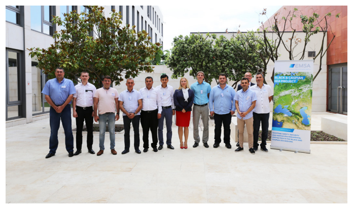
2-3/07/2019 - Training for MLC, 2006 Inspectors

25-26/09/2019 - Project Seminar on Search and Rescue