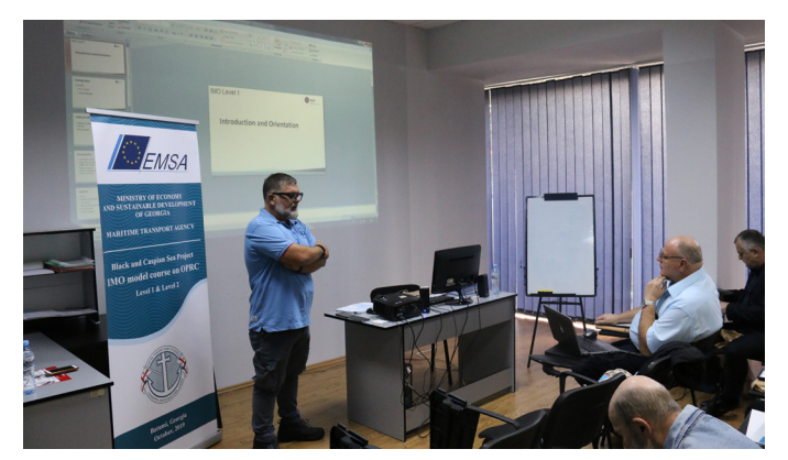
14-17/10/2019 – Georgia: IMO model course on OPRC level 2

The IMO OPRC Level 2 training course was mainly focused on the principles of the incident command system, the efficient implementation of contingency planning appraising spill impacts and environmental sensitivity, the main guidelines for safe and effective execution of oil spill response operations as well as the legal and compensation regimes.