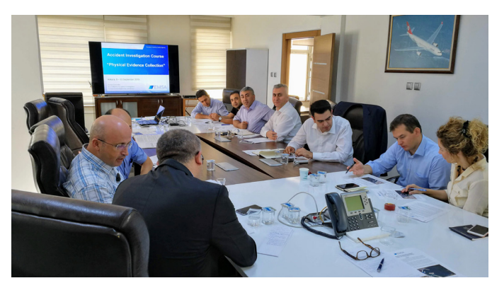
9-13/09/2019 – Turkey: Core Skills for accident investigators

On the request of Turkey's national maritime administration, a Core Skill Course for Accident investigators was carried out in Ankara. It introduced all relevant stages in the process of conducting a marine casualty safety investigation and raised the technical capacity of the Turkish accident investigators.