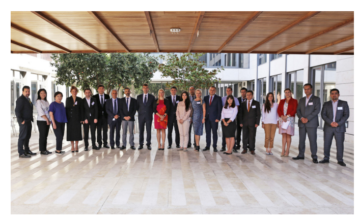
18/09/2019 - 3rd Steering Committee meeting

the flag State audits, the implementation of corrective or preventive actions as a result of flag State audits, the certification process, as well as the role and qualification of flag State auditors.