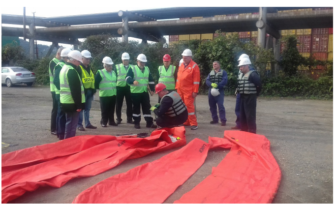
7-10/10/2019 – Georgia: IMO model course on OPRC level 1

IMO OPRC training courses provided the opportunity for Georgia's both Incident Command System and Emergency Response team members to reinforce their knowledge and skills in the oil spill response and preparedness mechanism. During the IMO OPRC Level 1 training, participants had the opportunity to familiarise themselves with the available oil spill response techniques and equipment by introducing guidelines for their use and the limitations, practice their response equipment, as well as comprehend the main health and safety hazards and precautions.