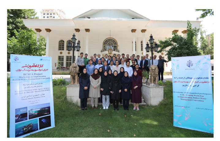
29-30/10/2019 – Participants in the training course on Ballast Water Management

A training course on the implementation and compliance with the requirements of the International Convention for the control and management of ballast and sediment from ships, 2004 (BWM 2004) was organised in co-operation with the Ports and Maritime Organization (PMO) of the Islamic Republic of Iran from 7 to 8 July 2019 in Tehran. The participants were provided with detailed information regarding the framework for compliance, monitoring and enforcement of the BWM Convention, an update on Ballast Water treatment technology, the PSC view of control, and sampling and type approval of BWM systems.