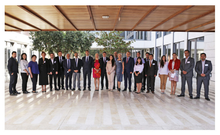
18/09/2019 - 3<sup>rd</sup> Steering Committee meeting

Azerbaijan, Georgia, Iran, Kazakhstan, Moldova, Turkmenistan, Turkey and Ukraine, DG NEAR, as well as the Commission on the Protection of the Black Sea Against Pollution participated in the Black and Caspian Sea regions project 3rd Steering Committee at EMSA premises in Lisbon. It was the opportunity to provide their priorities and expectations for bilateral and regional activities for the timeframe 2020 - 2021 and these were reflected in the project's Action plan subsequently approved by the Steering Committee.