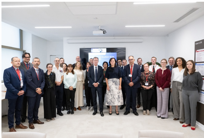
Delegates from the French and Belgian authorities gather at the closing ceremony of the EMSA-led Multipurpose Maritime Operation in La Manche and the Southern North Sea.