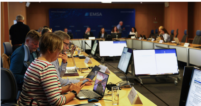
The CTG MPPR meeting gathered delegates from all over the EU at EMSA's headquarters