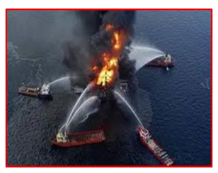
Response to pollution caused by oil and gas installations